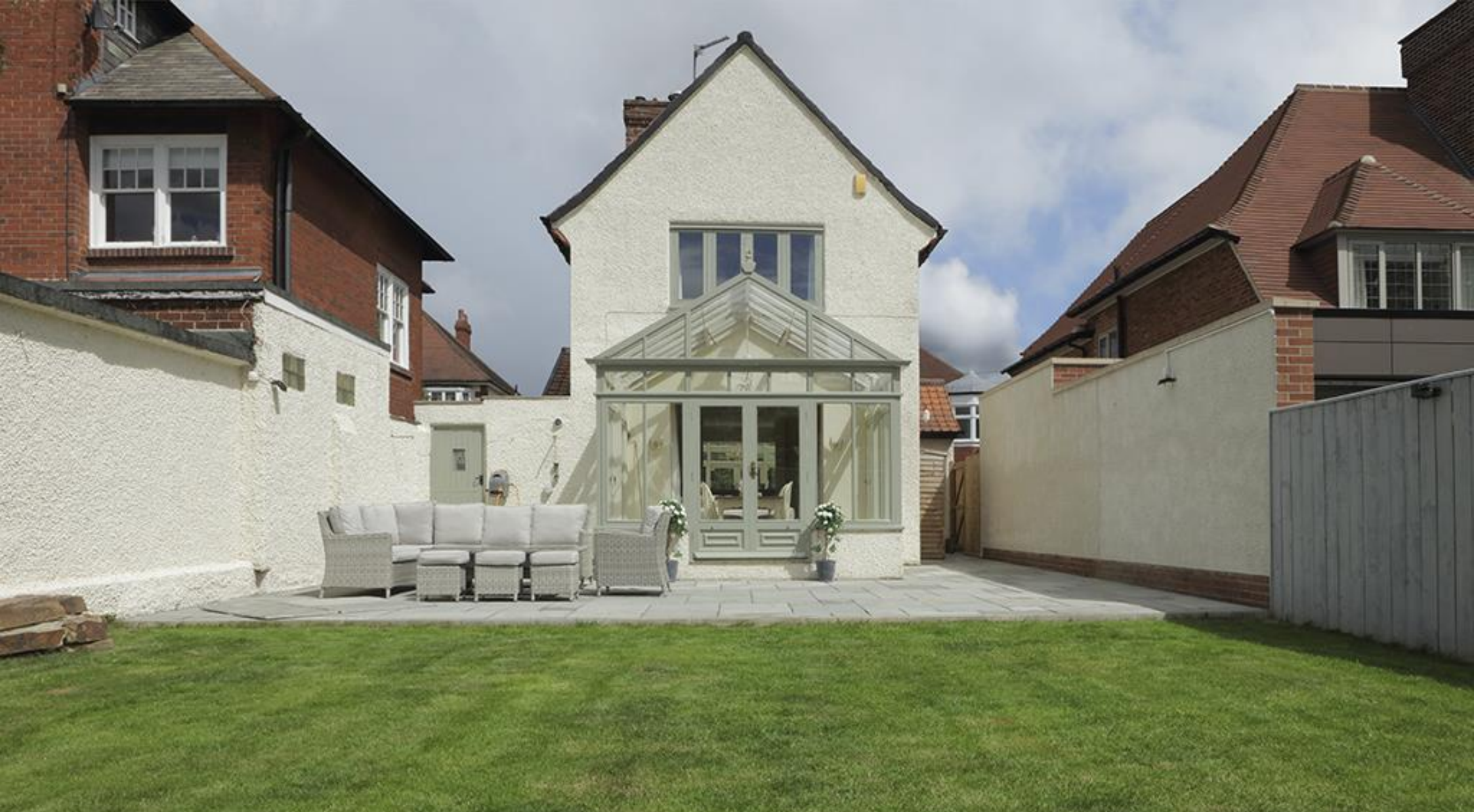
Westfield Cottage 18 Westfield Avenue, Gosforth