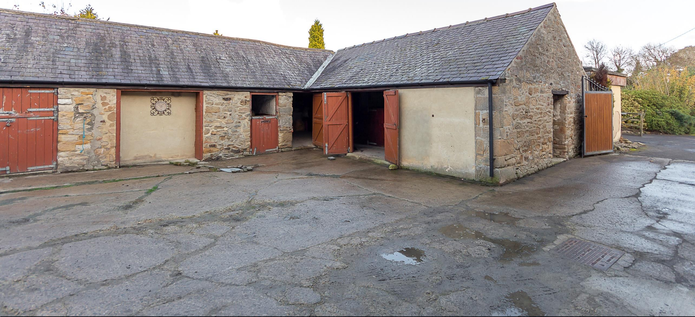
The Barn Low Thornley East Farm