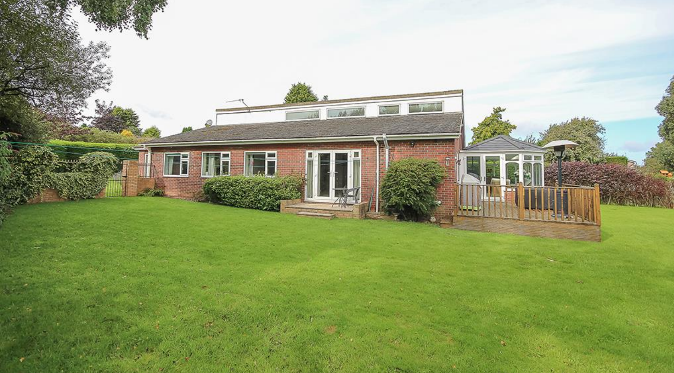
31 Callerton Court Darras Hall, Ponteland