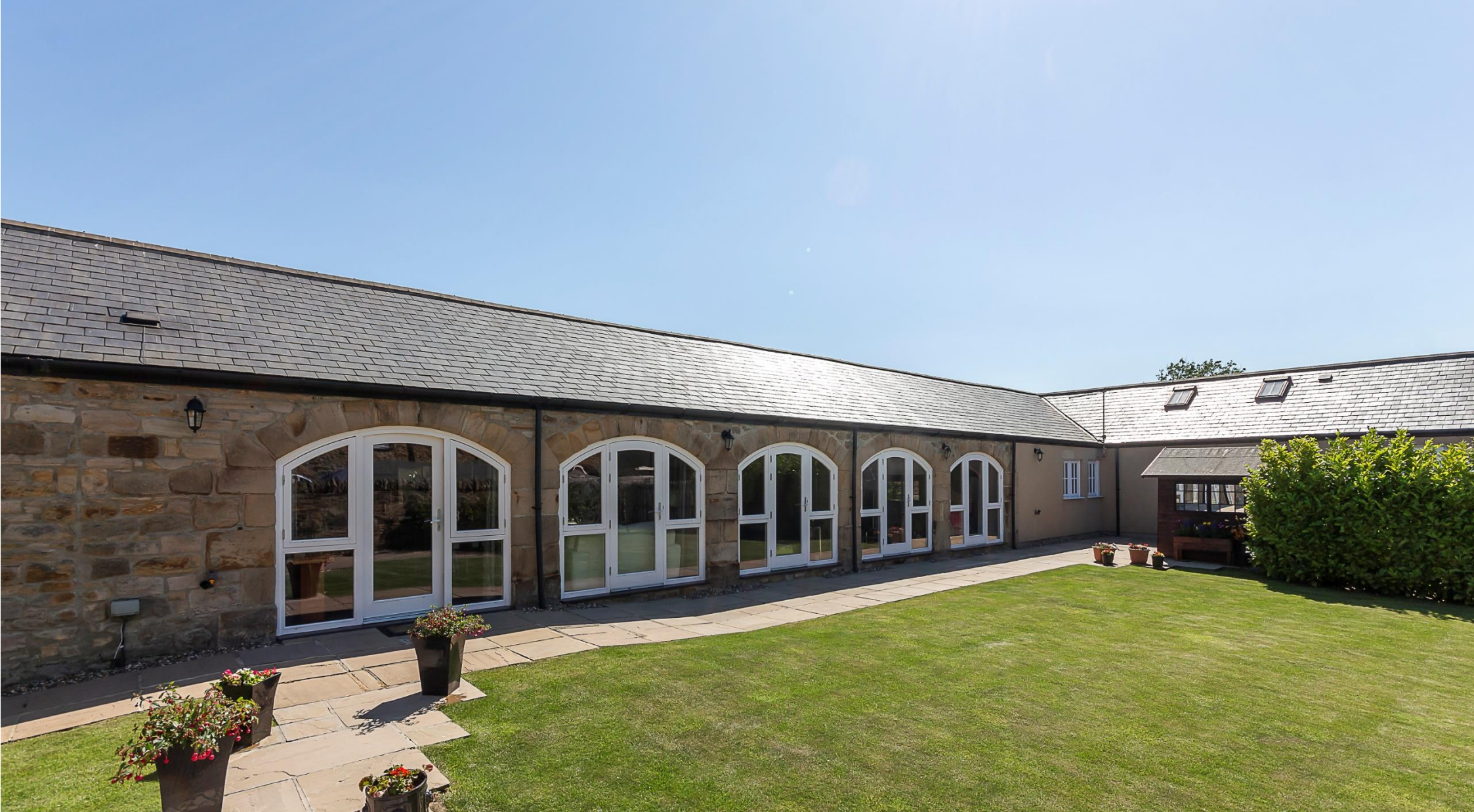
The Dairy, 6 Fell House Farm Road | North Walbottle