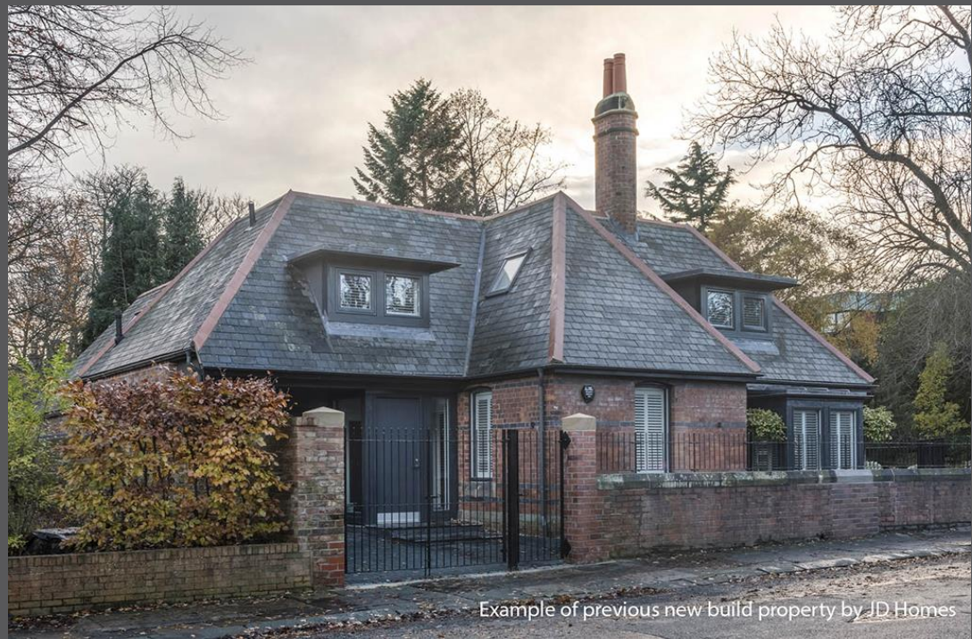
Example of previous new build property by JD Homes