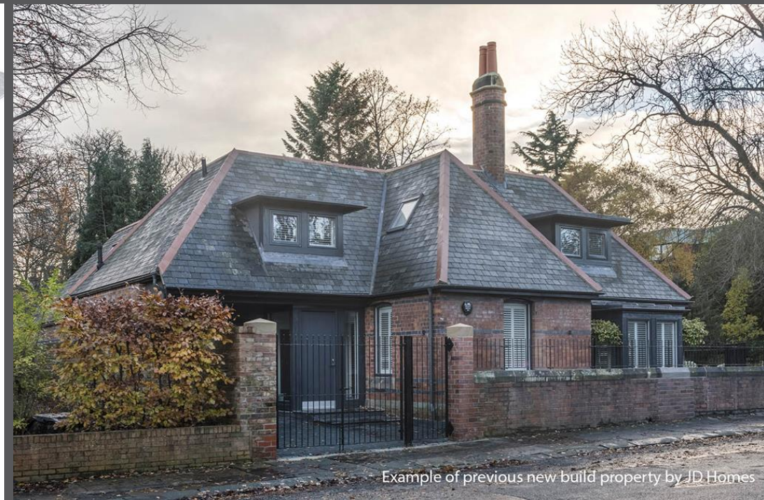
Example of previous new build property by JD Homes