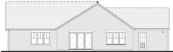
Rear Elevation 1:50