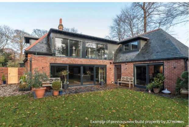
Example of previous new build property by JD Homes