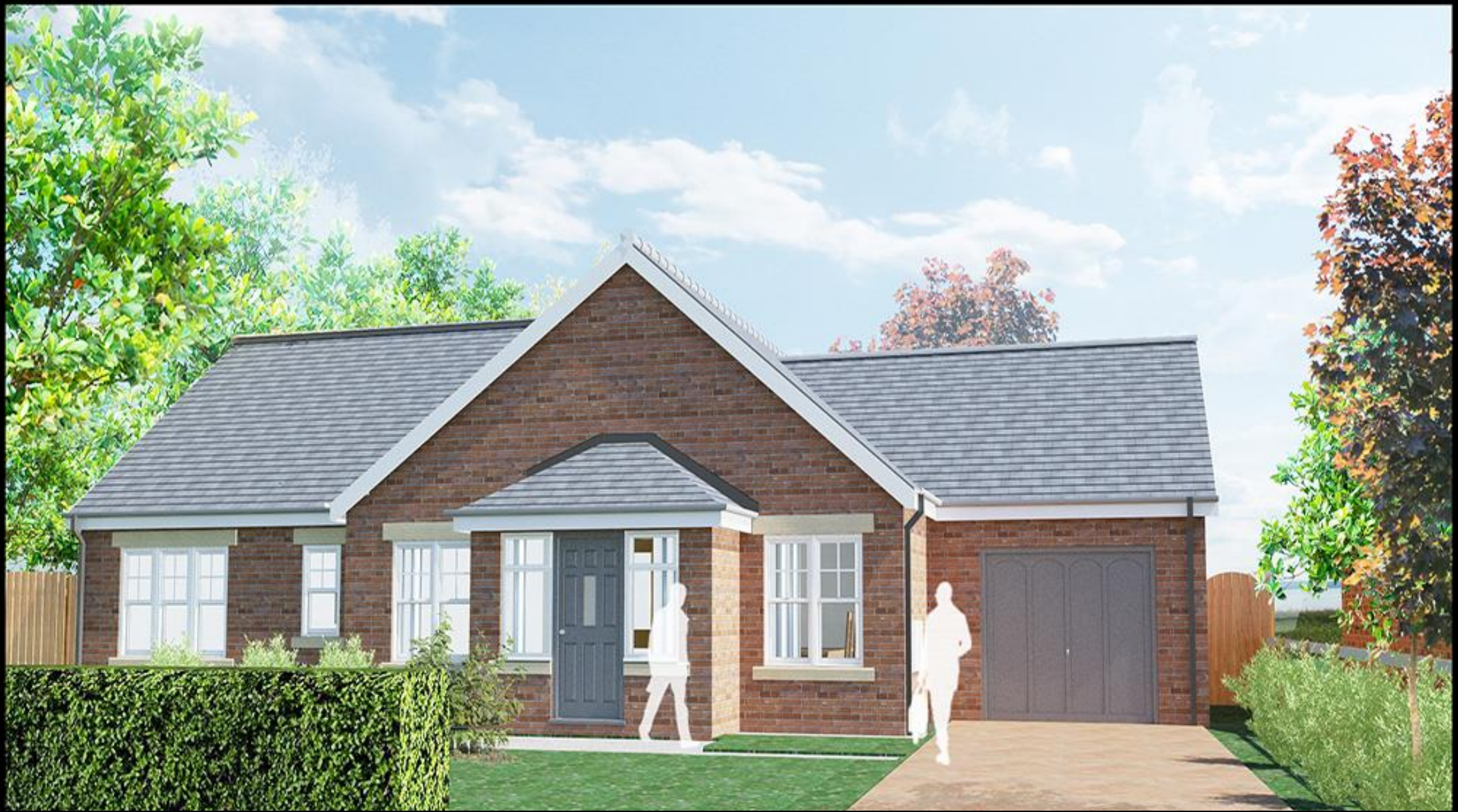
Plot 5, The Cheltenham The Stables, Stannington