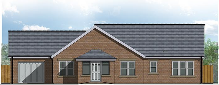
Front Elevation 1:50