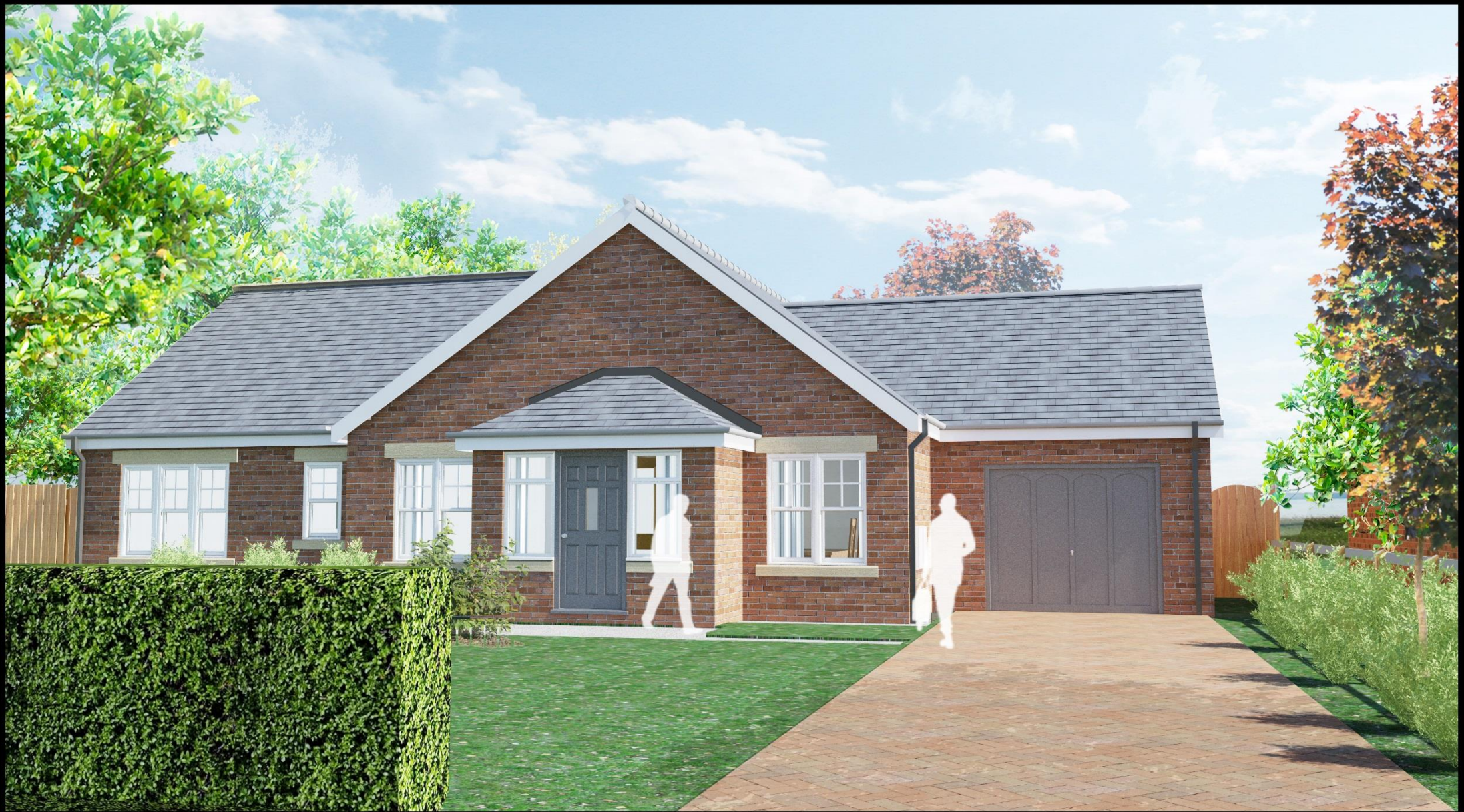
Plot 4, The Cheltenham The Stables, Stannington