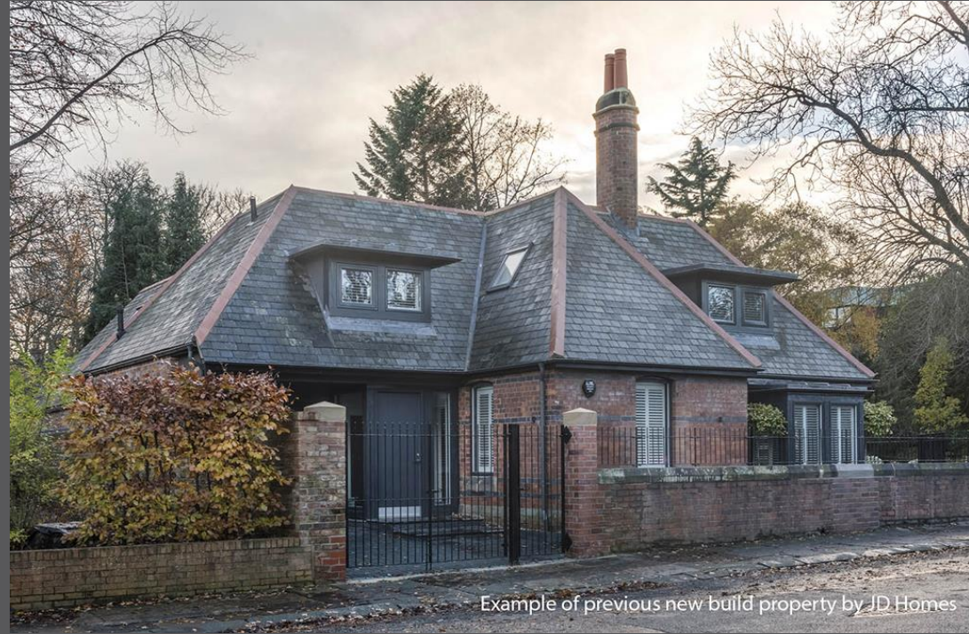
Example of previous new build property by JD Homes