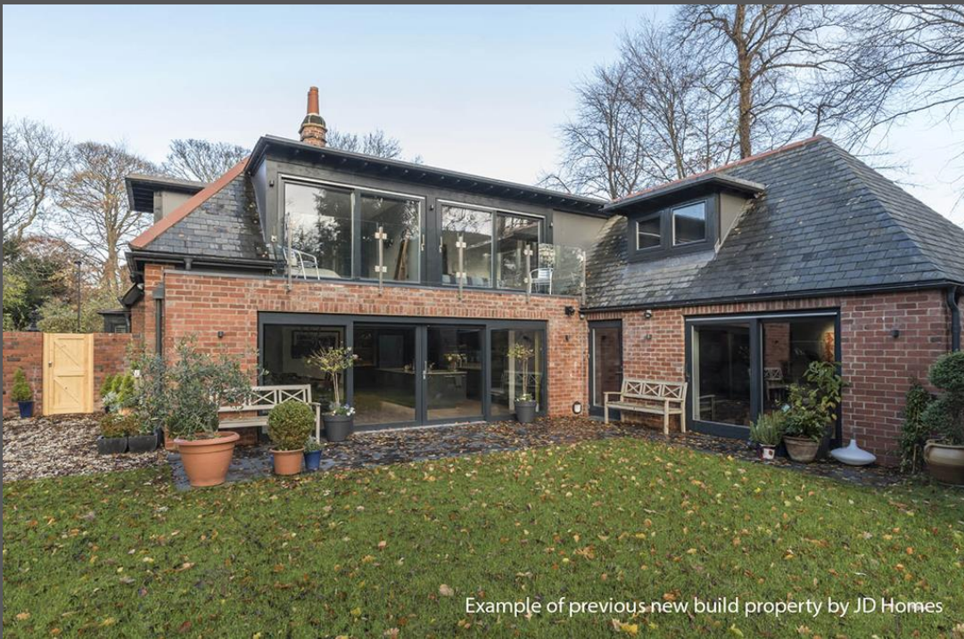
Example of previous new build property by JD Homes