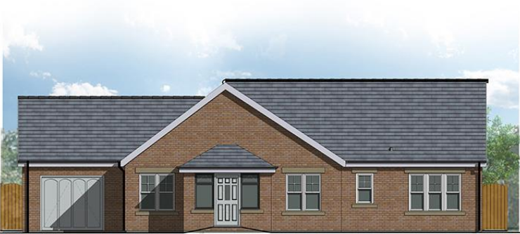
Front Elevation 1:50