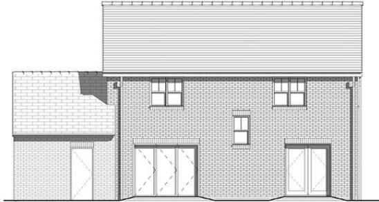
Rear Elevation 1 : 50