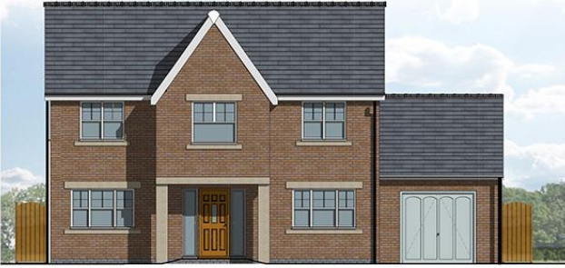
Front Elevation 1 : 50