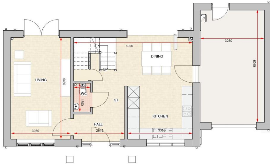
Level 0 1 : 50