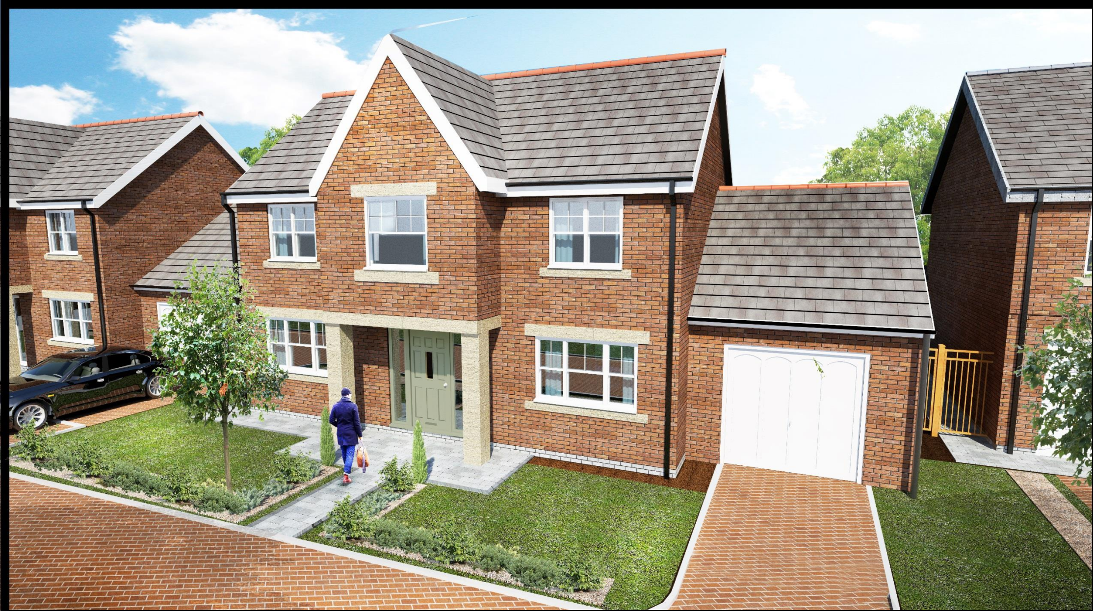
Plot 2, The Epsom The Stables, Stannington