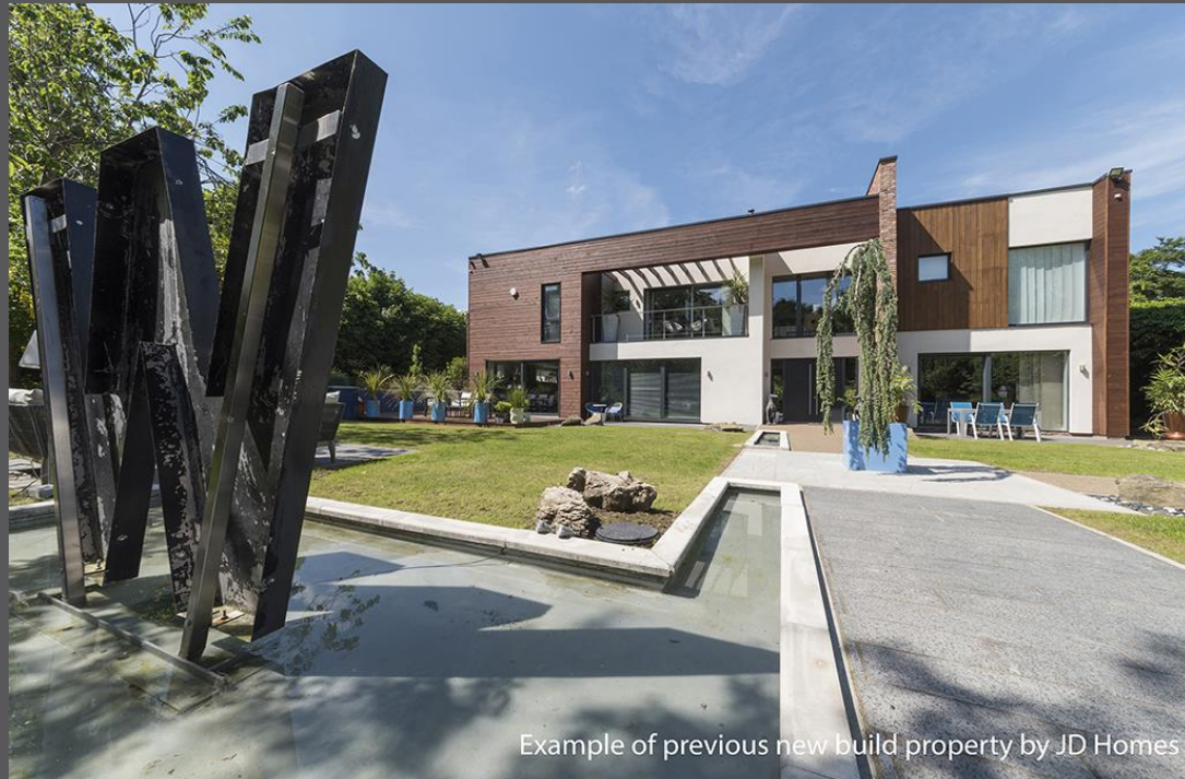
Example of previous new build property by JD Homes