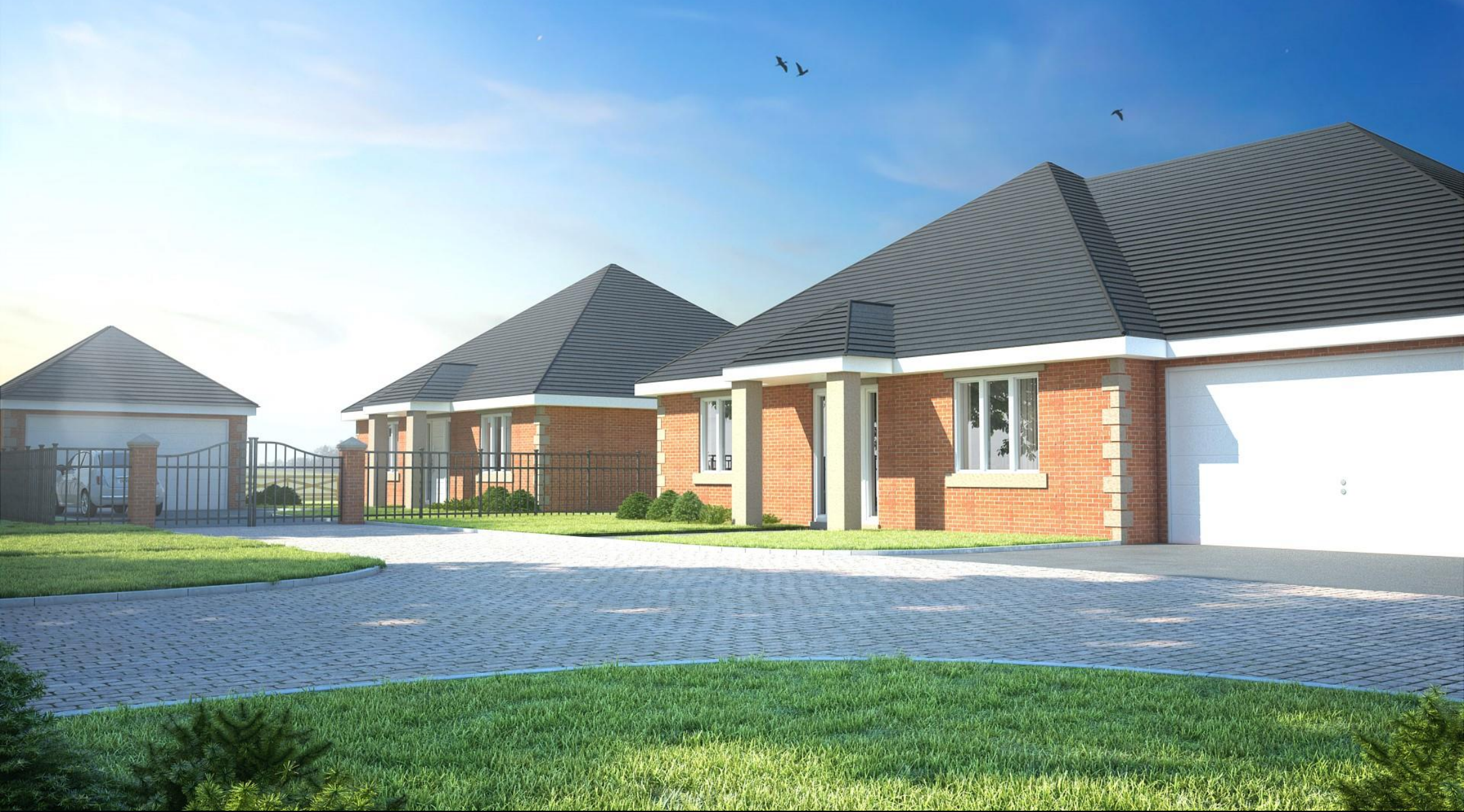
The Harrow (Plot 14) Furrow Grove