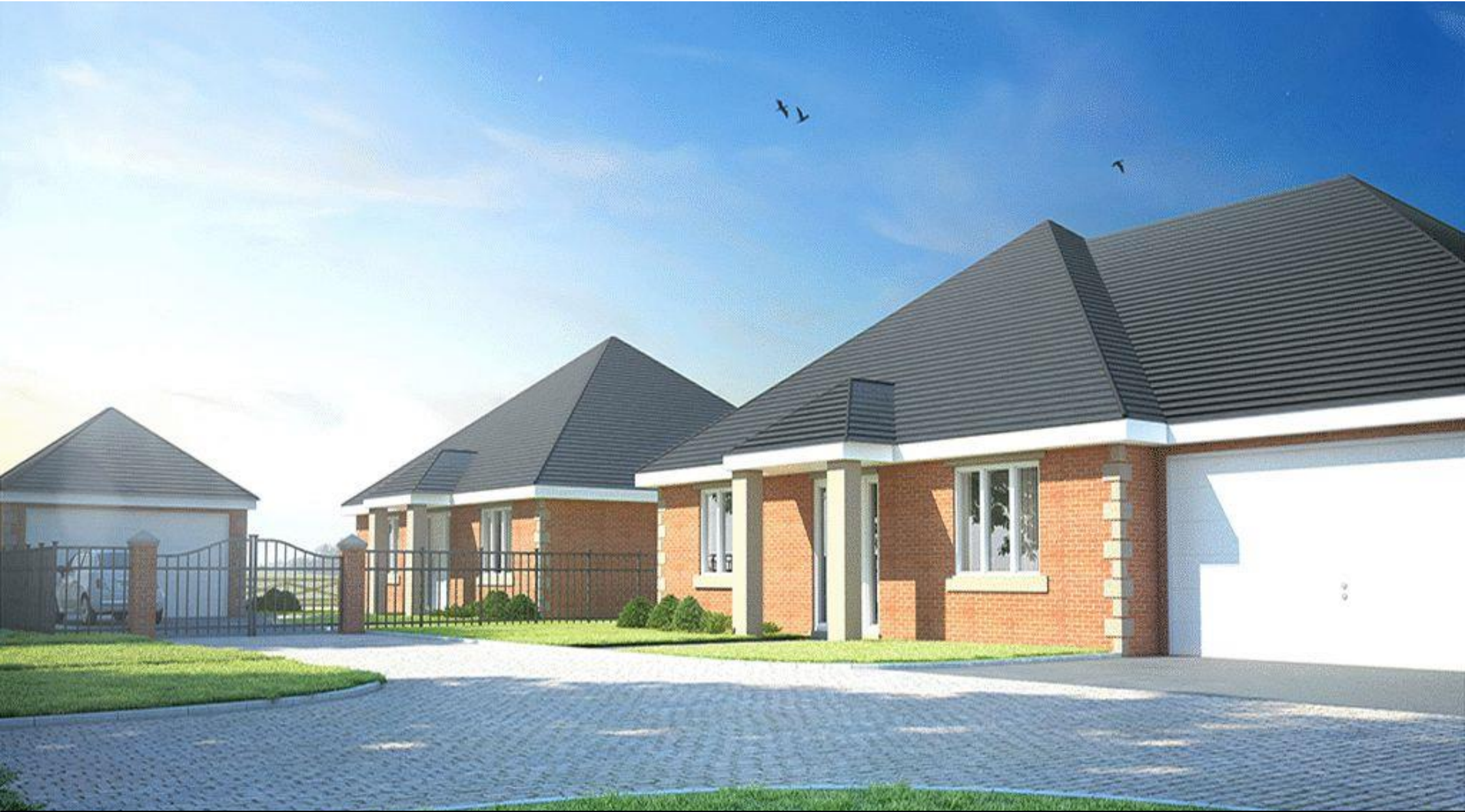
The Sickle (Plot 12) Furrow Grove