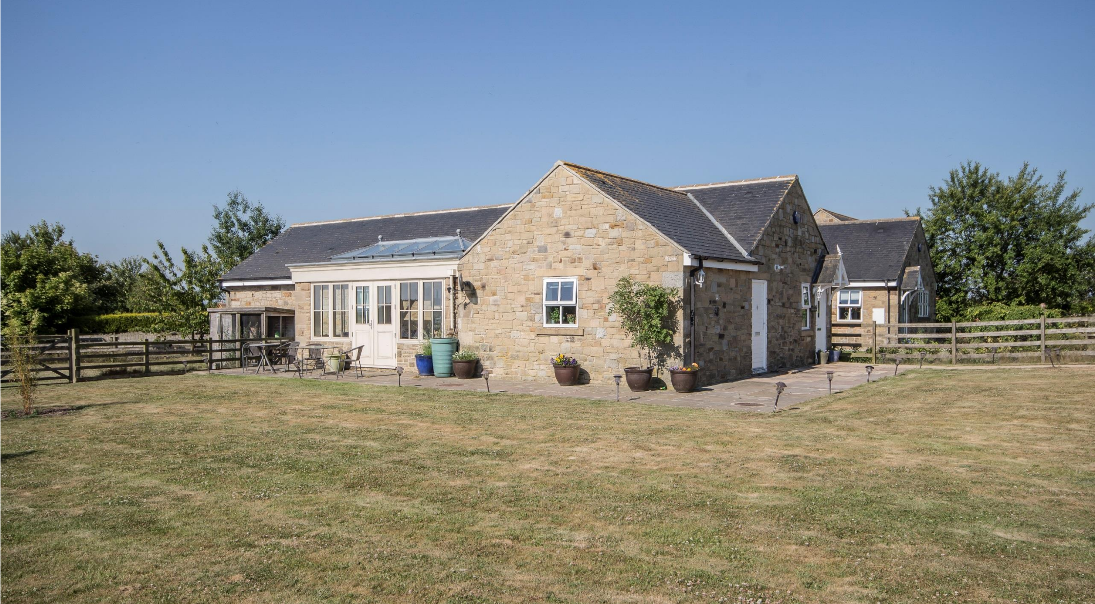
Callaly Cottage North Saltwick, Tranwell Woods