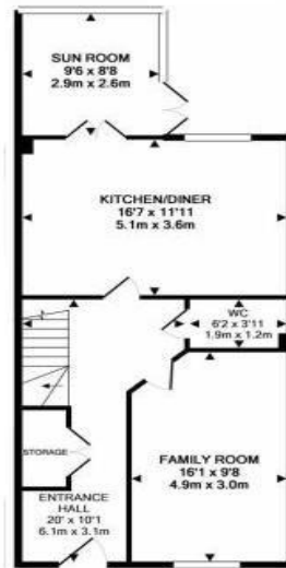
GROUND FLOOR APPROX. FLOOR AREA 601 SQ.FT. (55.6 SQ.M.)