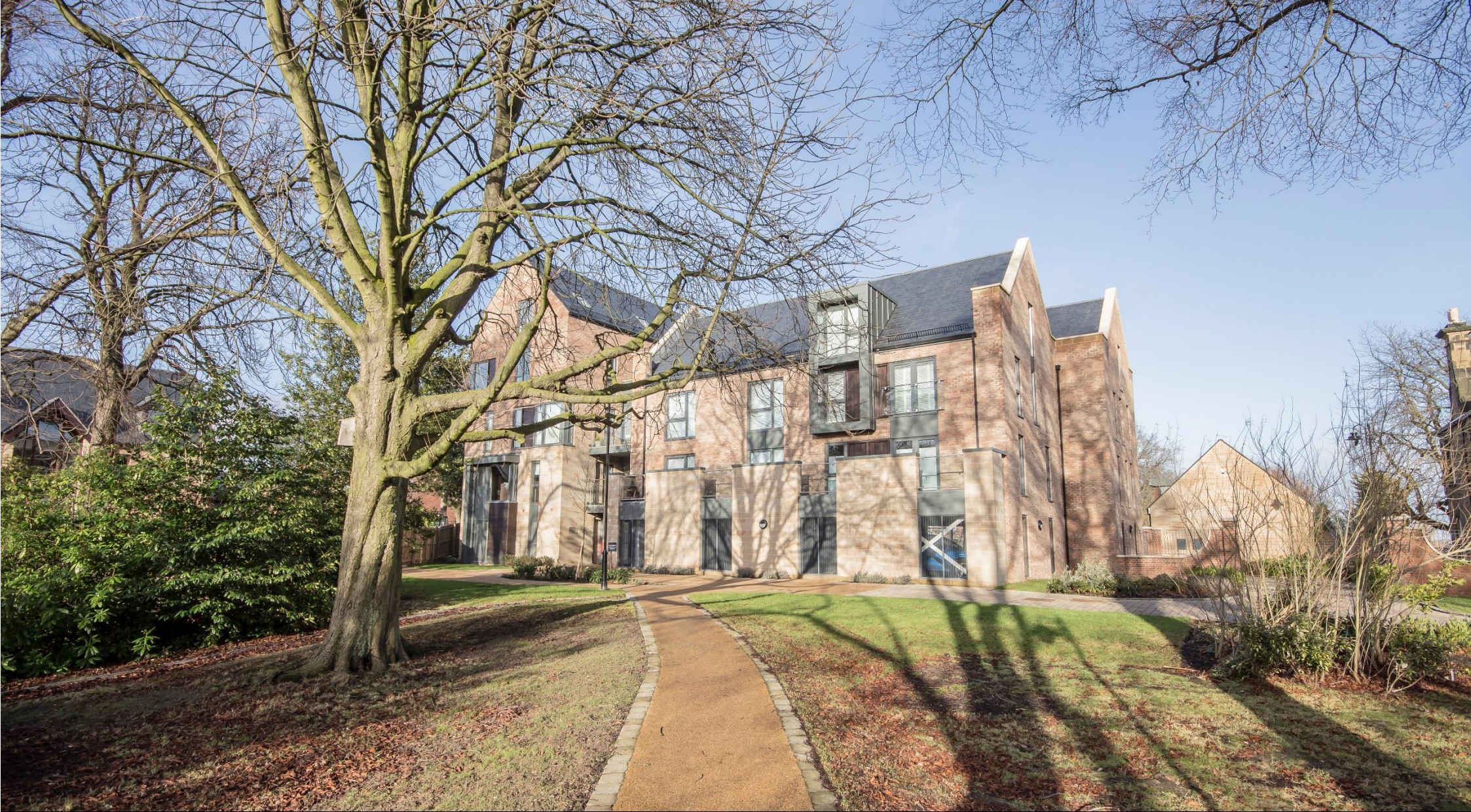
19 Melrose House Jesmond