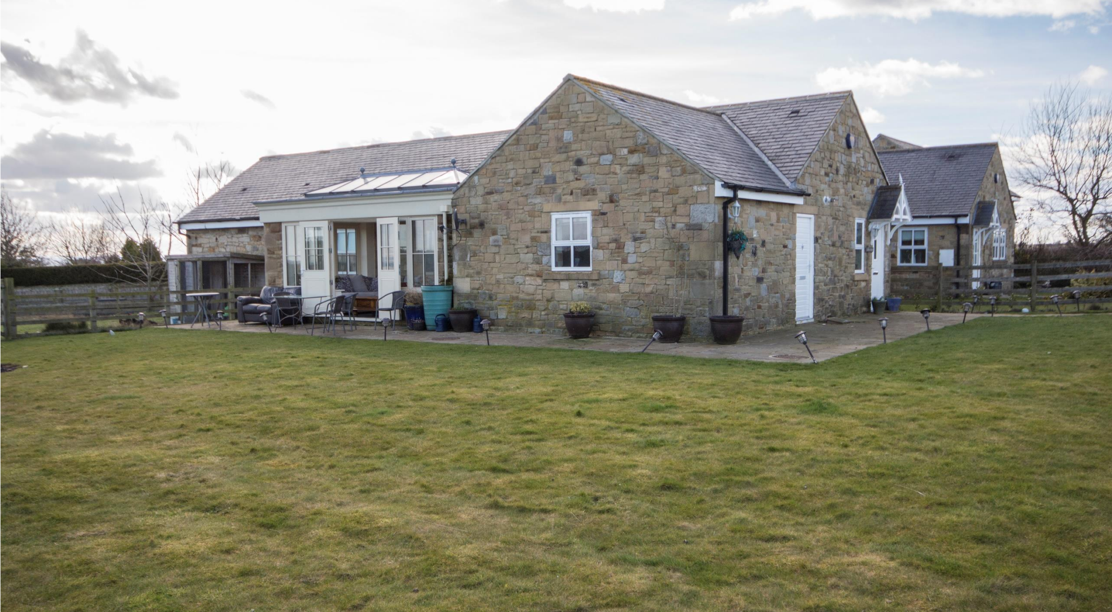
Callaly Cottage North Saltwick, Tranwell Woods