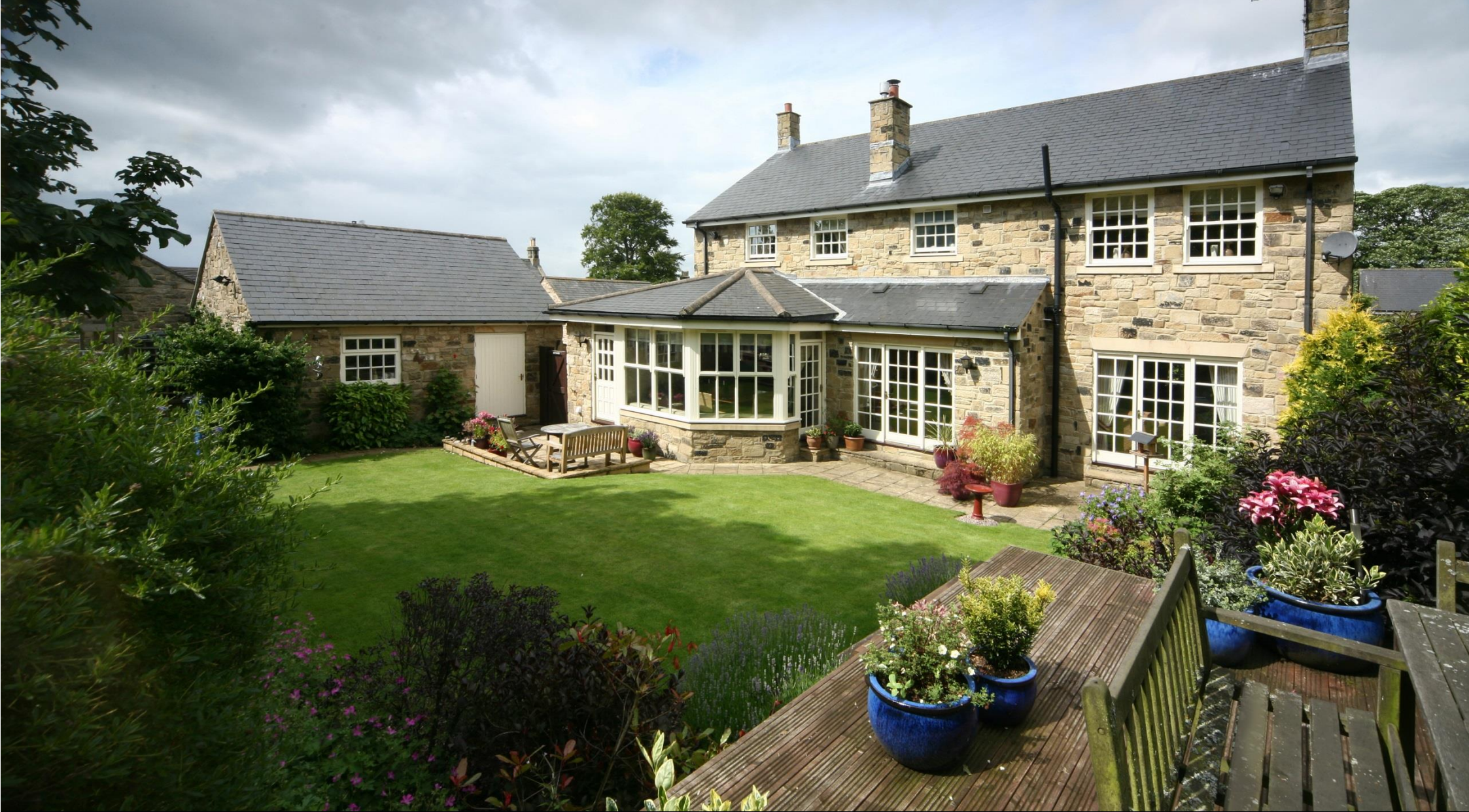
Rothley House Lynn Law Farm, Whalton