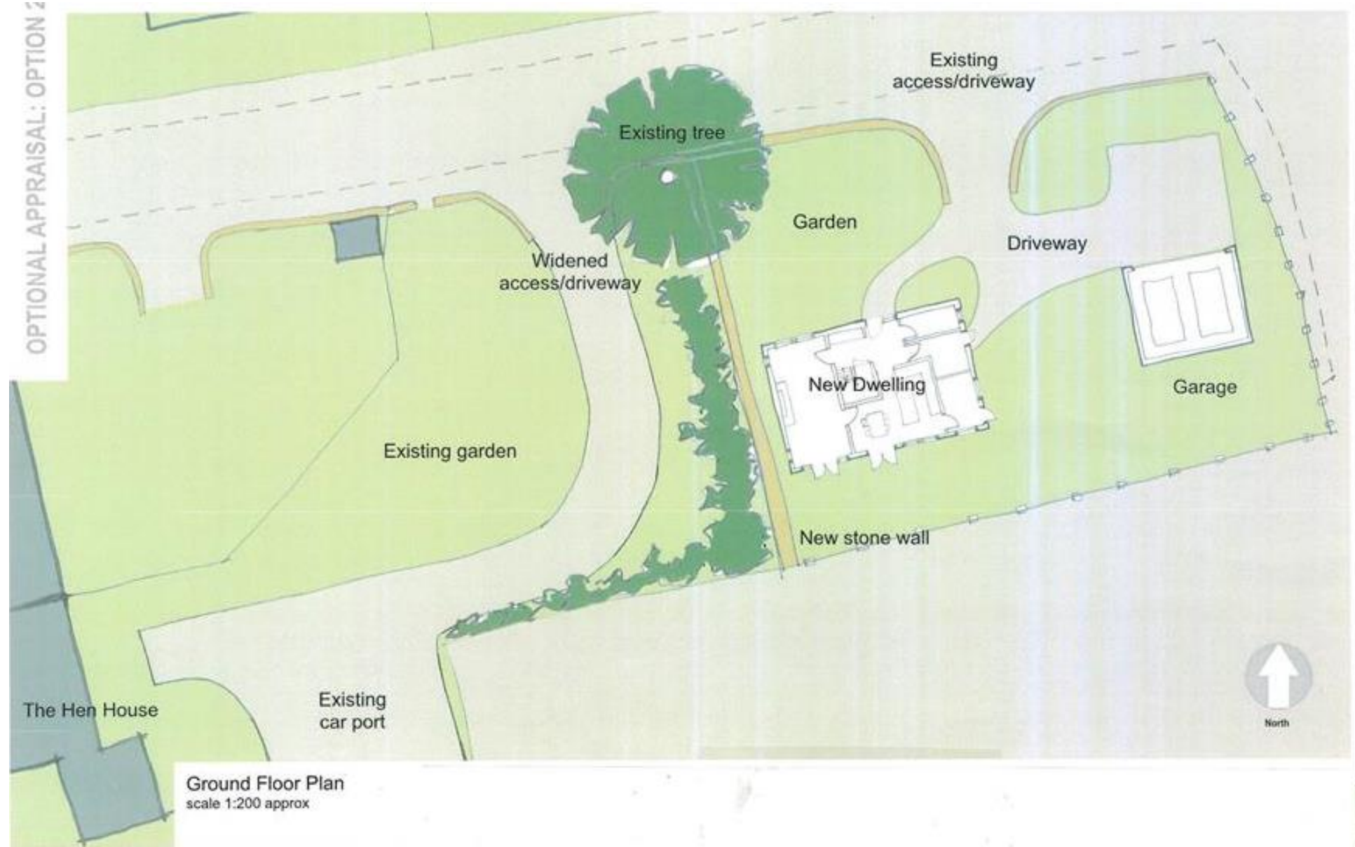
Ground Floor Plan scale 1:200 approx

All enquiries to our Gosforth Office | 95 High Street, Gosforth, Newcastle upon Tyne NE3 4AA T: 0191 213 0033 | www.sandersonyoung.co.uk