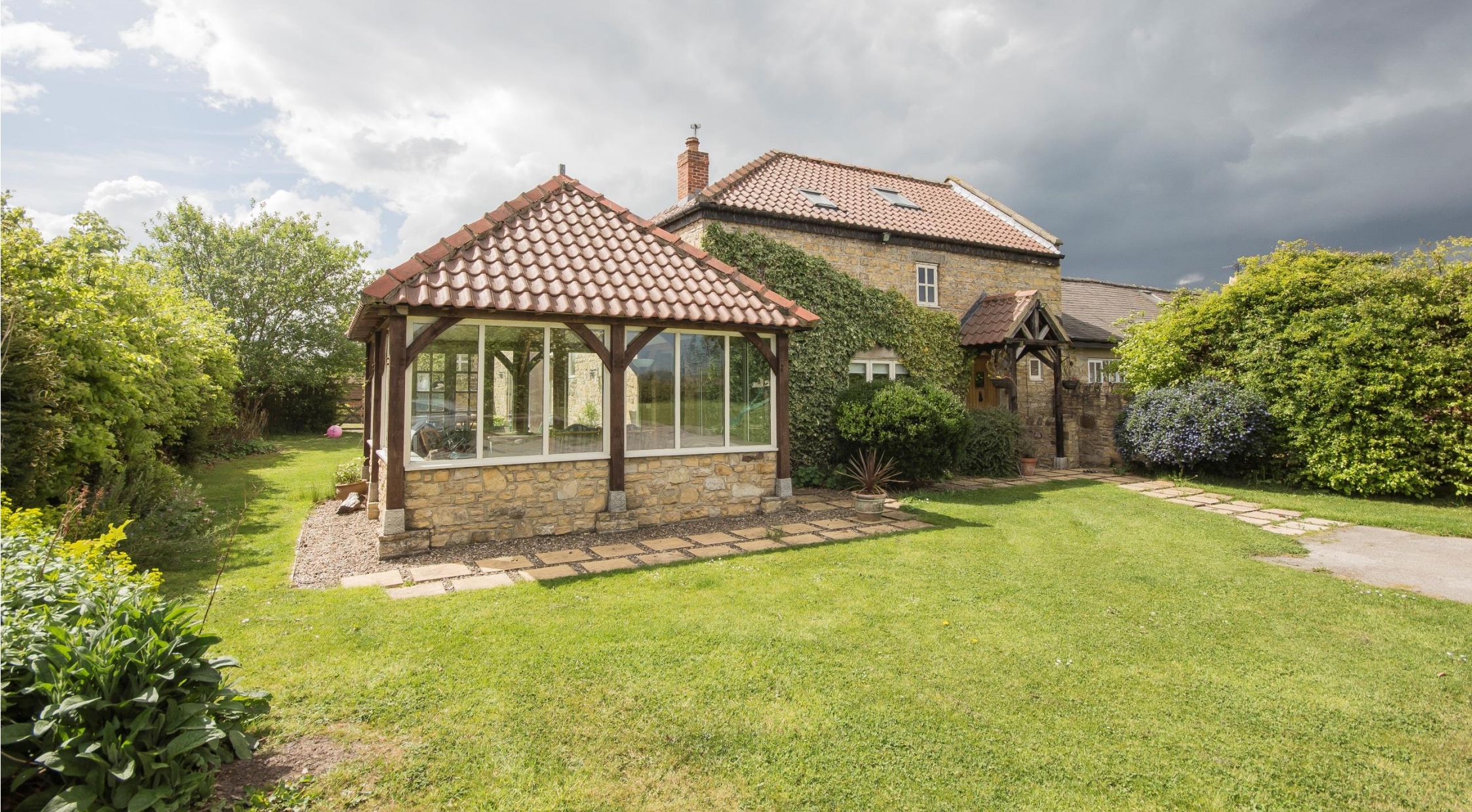
The Hen House Hetton Le Hill Farm, Houghton Le Spring