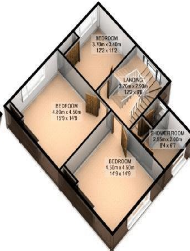
1ST FLOOR APPROX. FLOOR AREA 72.8 SQ.M. (784 SQ.FT.)