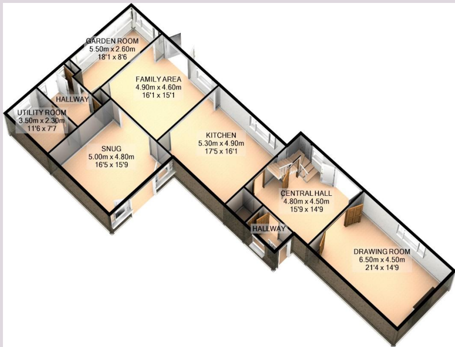
GROUND FLOOR APPROX. FLOOR AREA 158.6 SQ.M. (1707 SQ.FT.)