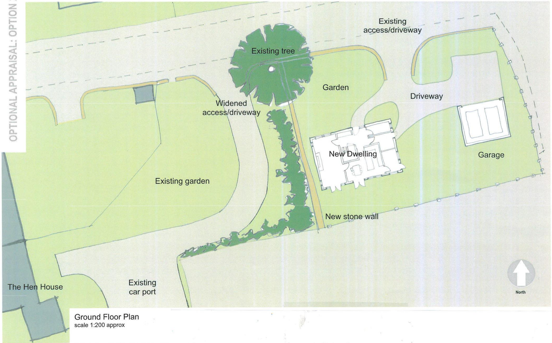
Ground Floor Plan scale 1:200 approx

All enquiries to our Gosforth Office | 95 High Street, Gosforth, Newcastle upon Tyne NE3 4AA