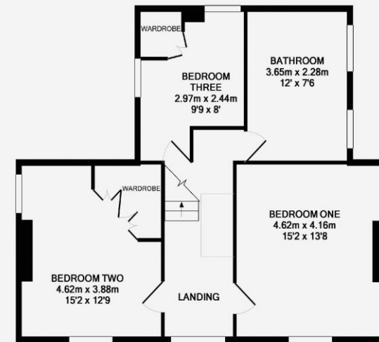
1ST FLOOR APPROX. FLOOR AREA 69.1 SQ.M. (744 SQ.FT.)